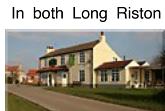
Bay Horse Inn Arnold