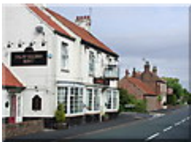
Travellers Rest Arnold and Arnold there were one

Most of the older houses in Long Riston are strung out for 1 km along Main Street, with a few in a short lane on the west side of the street named after the Lauty family. The church stands isolated in the fields near the north end of the village, approached by footpaths and by a carriage road set out at enclosure in 1778 and overgrown by 1989. The hamlet of Arnold lies a short distance west of the main road and close to Long Riston village, is now linked by a pedestrian roadway under the bypass. Few of the houses in either settlement are noteworthy. Those in Long Riston include Whinns Cottage, formerly called Overseer's Cottage, a terrace of small, 19th-century cottages, another terrace of four Gothic-style houses dated 1871, and 24 council houses built on a site acquired in 1945. Infilling with new houses was continuing in 1989.