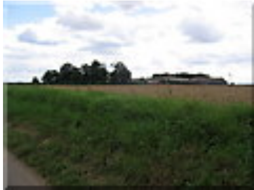
Figure 2 Woodhouse Farm

OUTLYING HOUSES in Long Riston include Riston Grange and half a dozen other farmhouses, all built after enclosure in 1778; a farmhouse called